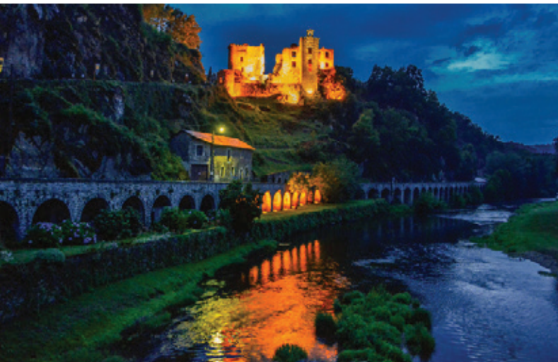
LEFT: St Martin Laguepie by the River Aveyron. BOTTOM: Local stone mason apprentice at work..